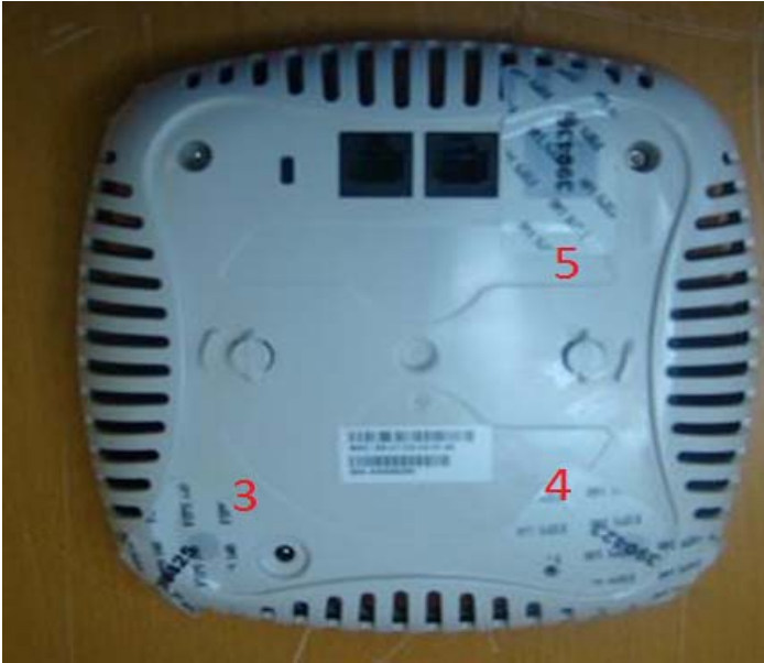
Figure 12: AP-135 Bottom View